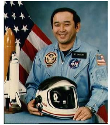
Ellison S. Onizuka Lt. Colonel USAF 1 NASA Astronaut (Hawaii’s first astronaut)

Each individual Scout must complete the requirements outlined in Good Citizenship, Effective Leadership and Self-Discipline.